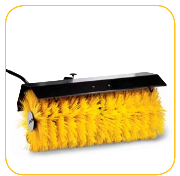
\pmb{SWEEPER, PTO-kit\ required}